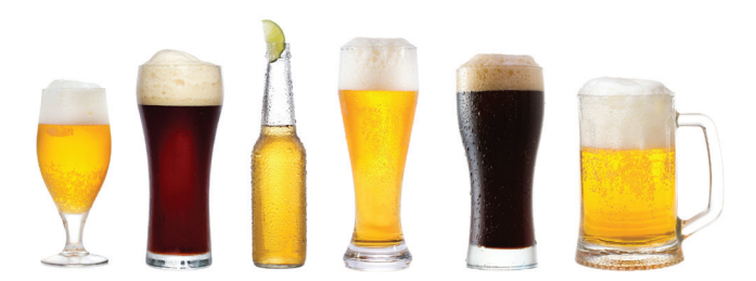
A range of ales, lagers and bitters treated with Carlson filters